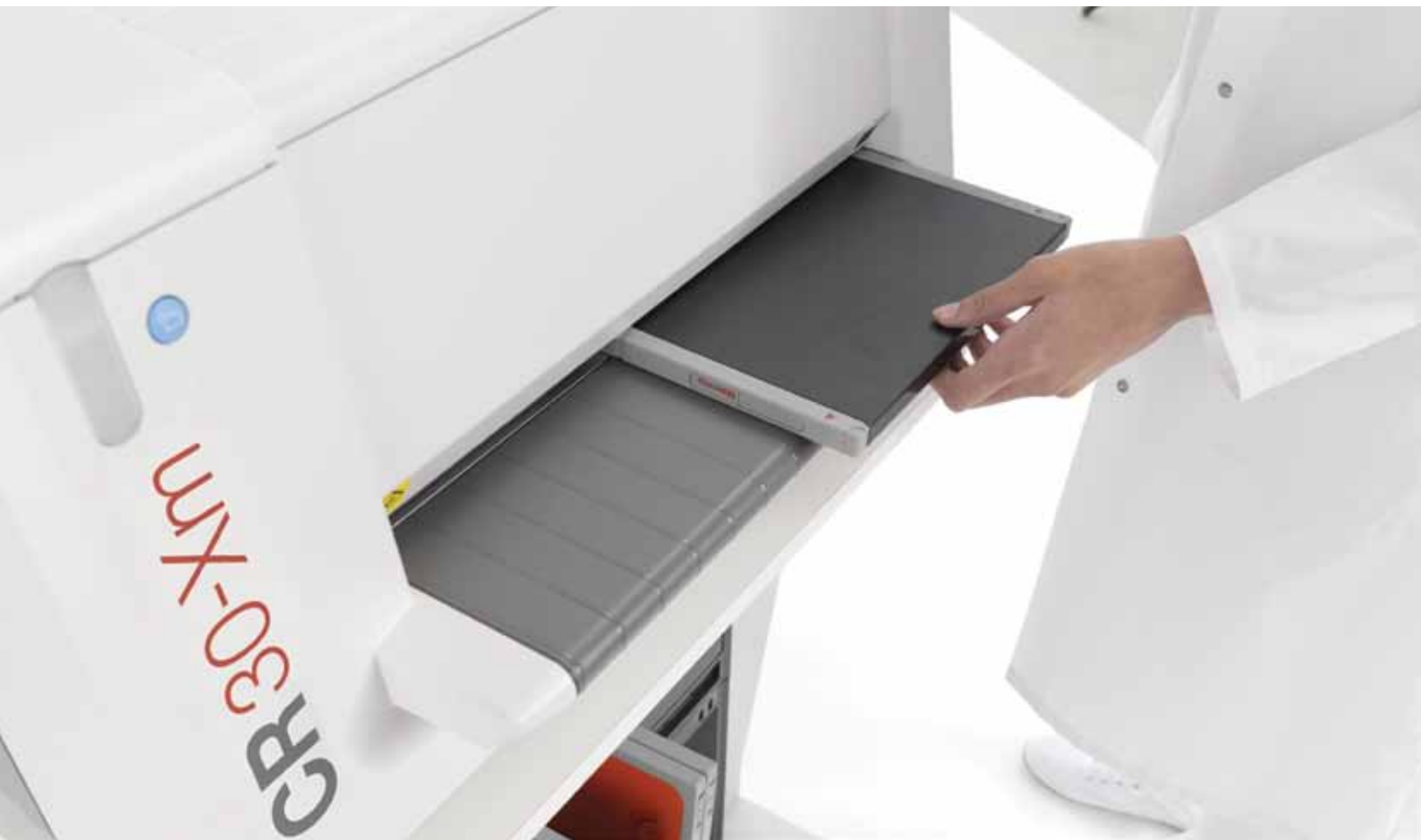
CR 30-Xm – Delivering an easy and cost-efficient transition from analog to digital.