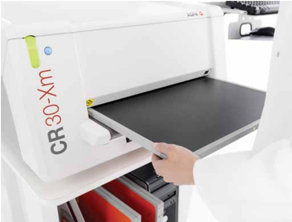
CR 30-Xm – Delivering an easy and cost-efficient transition from analog to digital.