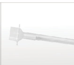
Child Catheter connection Exter Diameter: \Phi 9mm