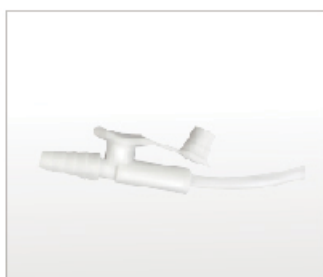
Fr 12 Catheter connection Exter Diameter: \Phi 4mm