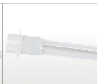
Adult Catheter connection Exter Diameter: \Phi 17mm